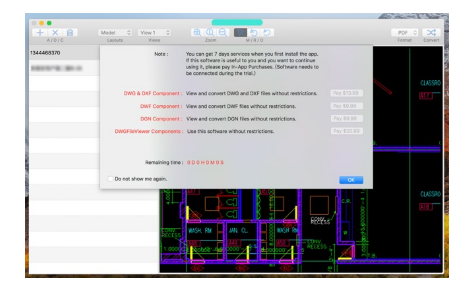
Drawings Viewer For Mac